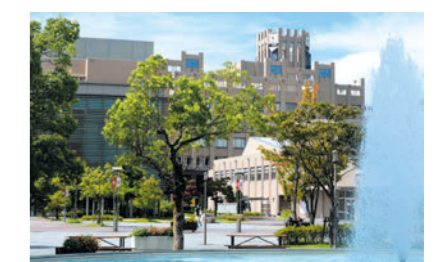
*Tracks Offered: RCJ, RCE

Biwako-Kusatsu Campus (BKC) serves as a center of education and research that integrates the sciences with the humanities. The campus is surrounded by natural beauty with mountains to the west and Lake Biwa, Japan's largest lake, to the east.