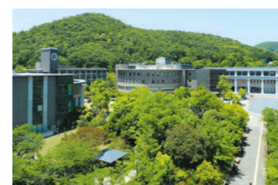
*Tracks Offered: IJL, RCJ, RCE

Kinugasa Campus (KIC) is the perfect example of Kyoto's harmonization between the traditional and the modern, and is a serene environment for education. Kinugasa is the university's center of liberal arts, social science and humanities studies.