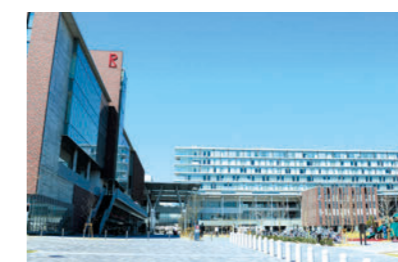
*Tracks Offered: RCJ, RCE

Located midway between Osaka City and Kyoto City, Osaka Ibaraki Campus (OIC) is RU's newest campus. The campus community works to facilitate collaboration with industry and government institutions and promote Ritsumeikan's activities on the frontline of social collaboration.