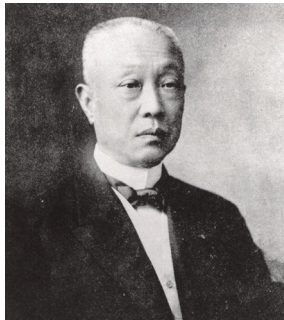
Kinmochi Saionji (1849-1940)

After World War II, Ritsumeikan adopted the educational philosophy of peace and democracy, faithful to the spirit of the Japanese Constitution and the Education Fundamental Law. In 1948, Ritsumeikan became one of the first Japanese universities to be reorganized under the new education system. Ritsumeikan carried out extensive reforms to ensure democratic