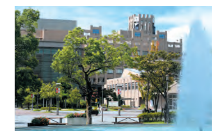
*Tracks Offered: RCJ, RCE

Biwako-Kusatsu Campus (BKC) serves as a center of education and research that integrates the sciences with the humanities. The campus is surrounded by natural beauty with mountains to the west and Lake Biwa, Japan's largest lake, to the east.