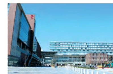
*Tracks Offered: RCJ, RCE

Located midway between Osaka City and Kyoto City, Osaka Ibaraki Campus (OIC) is RU's newest campus. The campus community works to facilitate collaboration with industry and government institutions and promote Ritsumeikan's activities on the frontline of social collaboration.