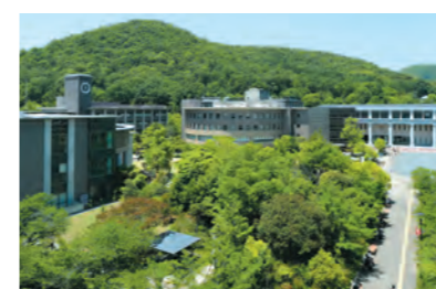
*Tracks Offered: IJL, RCJ, RCE

Kinugasa Campus (KIC) is the perfect example of Kyoto's harmonization between the traditional and the modern, and is a serene environment for education. Kinugasa is the university's center of liberal arts, social science and humanities studies.