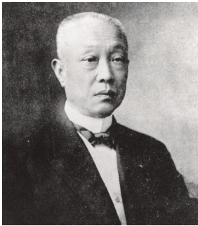
Kinmochi Saionji (1849-1940)

After World War II, Ritsumeikan adopted the educational philosophy of peace and democracy, faithful to the spirit of the Japanese Constitution and the Education Fundamental Law. In 1948, Ritsumeikan became one of the first Japanese universities to be reorganized under the new education system. Ritsumeikan carried out extensive reforms to ensure democratic